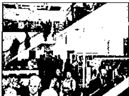
The opening of the LRC (see article to the right)

2005- What can we expect from DHSB in future years? The next main project the school is currently undertaking is the formation of a new 6 th Form centre. Plans are currently being made and we should be able to see construction within the next half year.